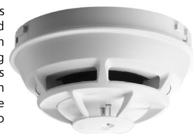
Model FDOT421 Multi-Criteria Fire Detector

Each Model FDOT421 detector provides three (3) pre-programmed parameter sets that can be selected by the FACP.